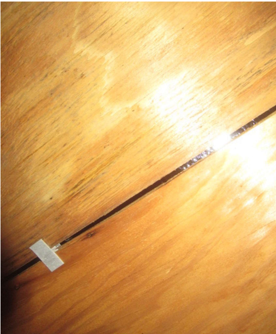
SWR installed under the tile