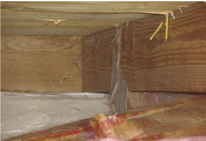
Single strap with 2 nails into the truss