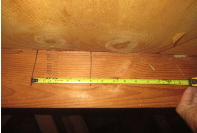
6" spacing in the field