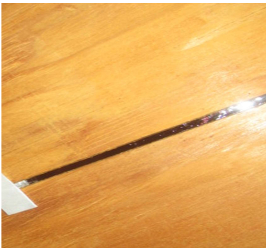
SWR installed under the tile