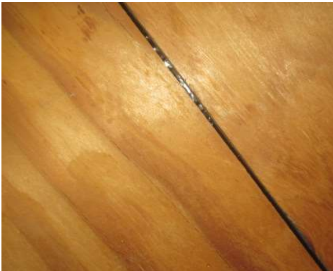
SWR installed under the tile