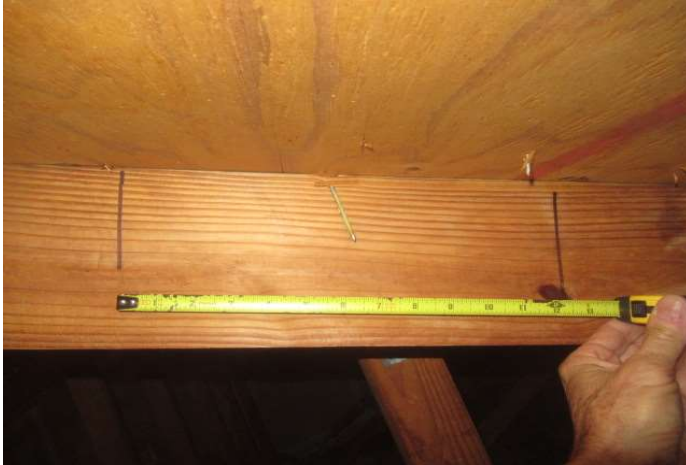
6" spacing in the field